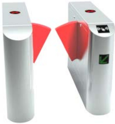
KK-W06 (Wing Gate)